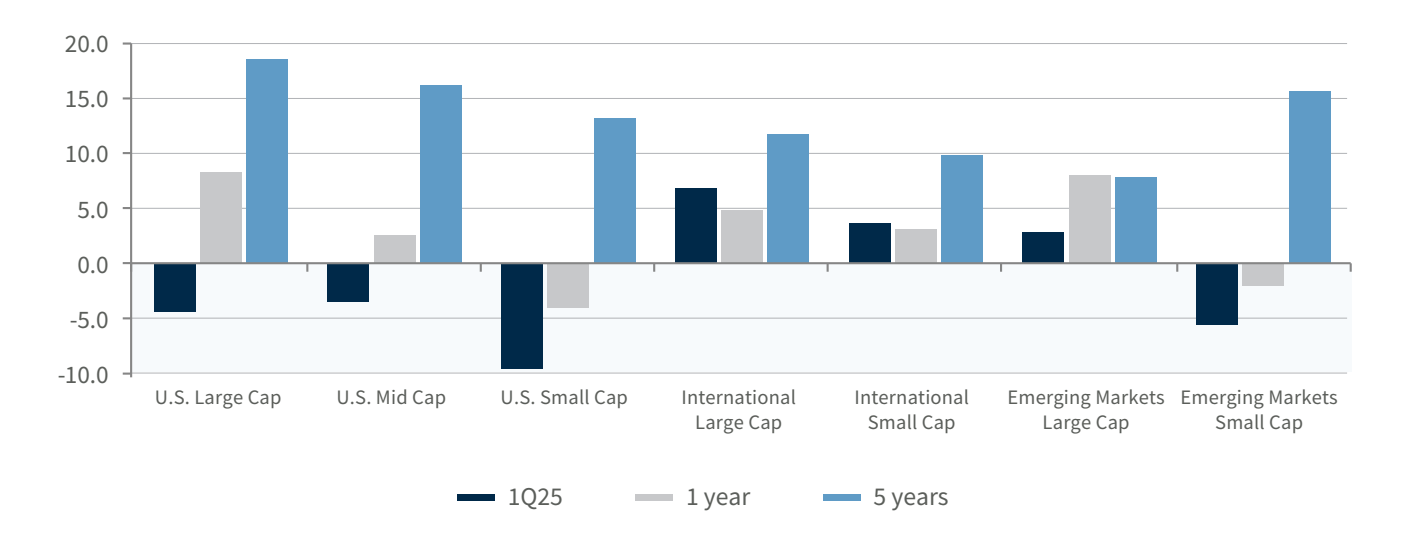
EQUITY RETURNS

The release of DeepSeek, a Chinese AI model produced at a much lower cost than leading U.S. models, complicated the quarter for the large domestic AI companies that have driven much of the headline gains for large-cap U.S. equity for the past two years. Priced to perfection at the end of 2024, those companies now face pressure to prove their high valuations.