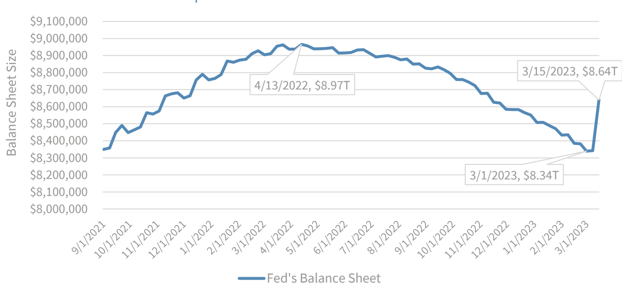
Graph 2: Federal Reserve's Balance Sheet

core inflation with it. The European Central Bank was faced with a similar challenge last week as they decided to hike rates 50 basis points while remaining committed to further data releases. The swift and unconventional merger of UBS and Credit Swiss Group AG over the weekend, along with increased dollar fundings between the Fed and five other major developed central banks have provided support and served as the major backstop to ease global funding stress. We believe recent events have magnified the difficulty for central banks to engineer soft landings, but the paths to travel there remain unchanged short of any sudden and severe further deterioration of global market conditions.